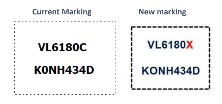
Figure 2: Box label